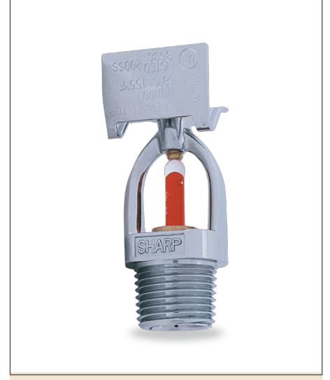
Horizontal Sidewall Sprinkler – UL Approved