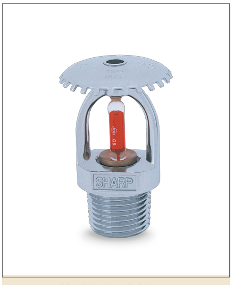
Upright Sprinkler – UL Approved